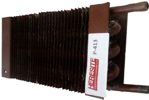
P-413 1,000 hour SWAAT