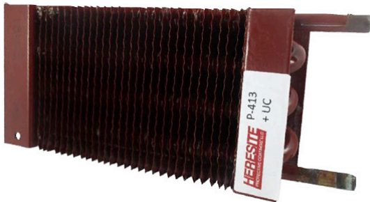
P-413 + topcoat 1,000 hour SWAAT